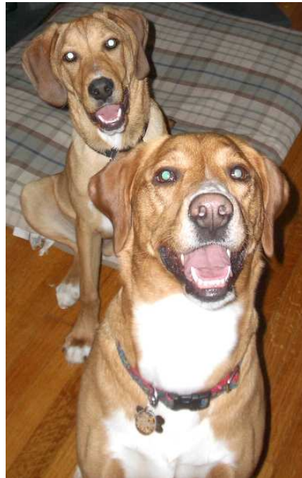
Bailey (in front) and Tracker.