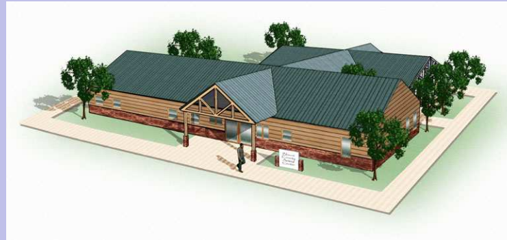
Artist's rendering of the proposed Blount County Animal Care Facility .

Initial cost estimates prepared by SMACF place the cost for building the facility at $1.2M. With a beginning on-site staff of a director, veterinarian, two technicians, two animal control officers, a receptionist and other volunteers, the facility will be equipped to address many of the shortcomings facing other area animal shelters. Injured and sick animal will be provided with necessary vet care when they arrive. Staff and volunteers will make every effort to place as many adoptable animals as possible. The public will be able to visit with their potential pet in a friendly and welcoming environment, and all animals will be spayed or neutered before leaving the facility.