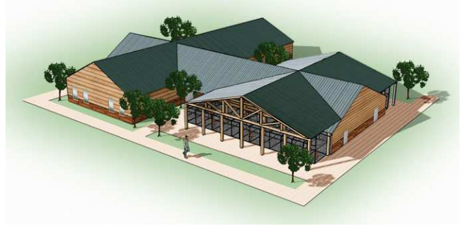
A side view of the Animal Care Facility, showing outside access from interior dog kennels.